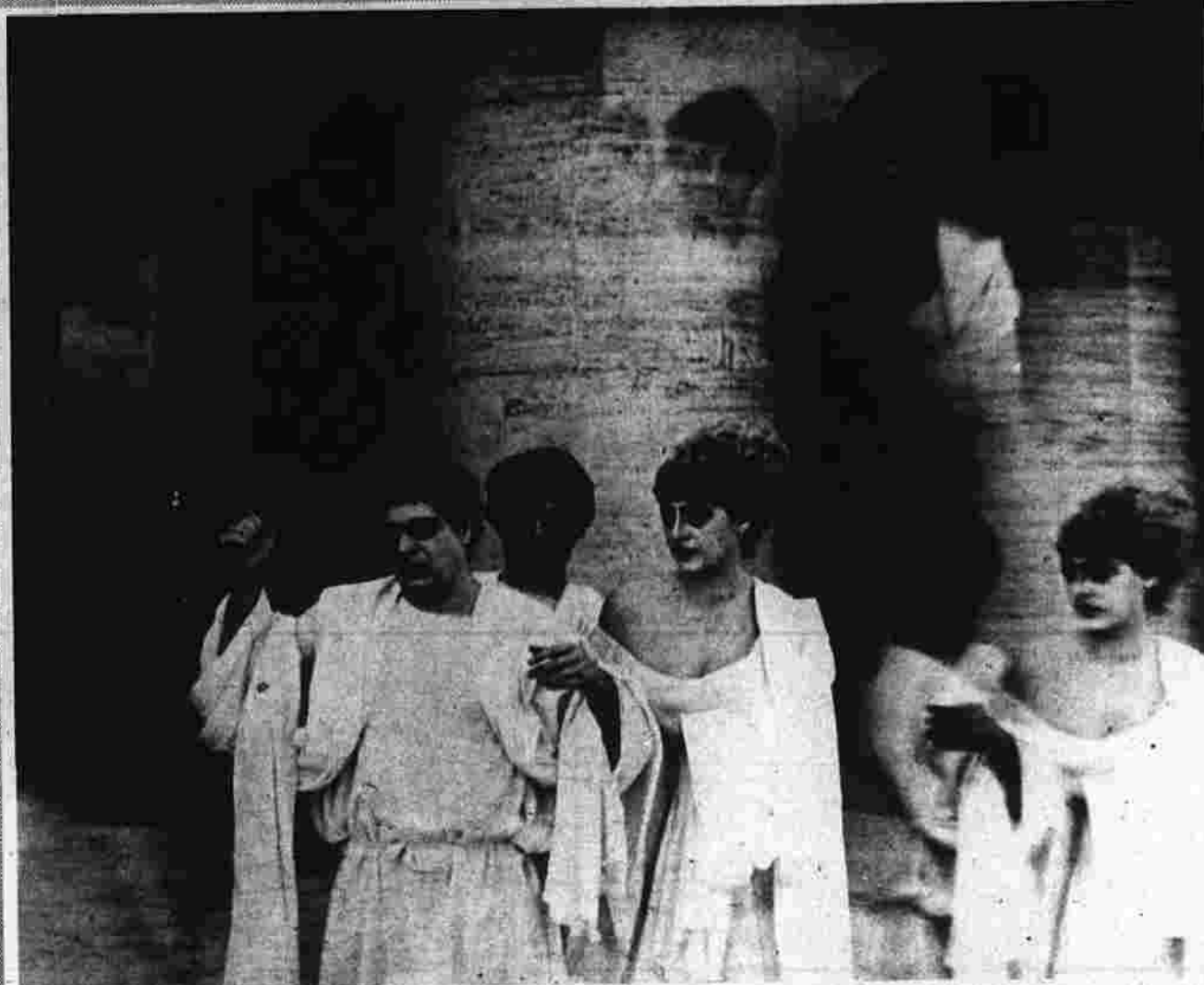
Childhood memory in Fellini film about Fellini, Friday at 10 on NBC.