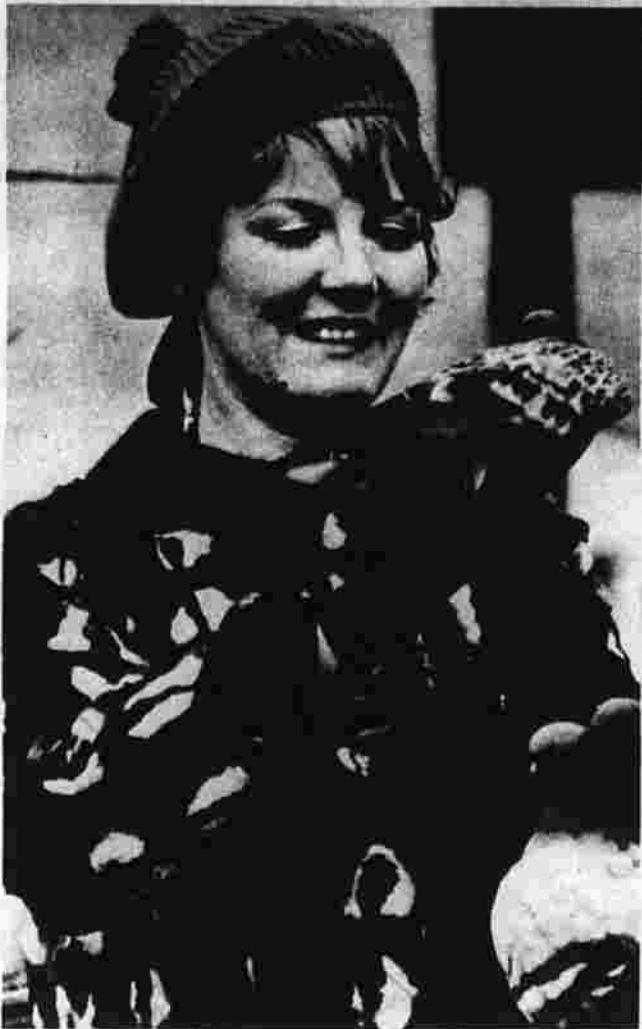
Petula Clark with pigeon in London park on "Portrait of Petula" Monday from 8 to 9 p.m. on NBC.