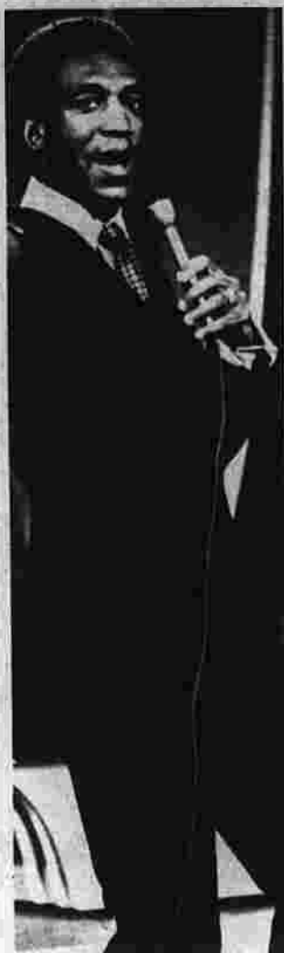
Bill Cosby, Part II

The comedian, in a one-man show, recalls a karate-chopping grandmother, a night in bed with his brother and the unauthorized version of the story of Noah's Ark on "The Second Bill Cosby Special," Wednesday 10-11 p.m. on NBC.