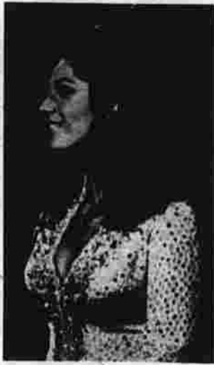
Lainie Kazan on ABC's "This Is Tom Jones" Friday, 7:30-8:30 p.m.