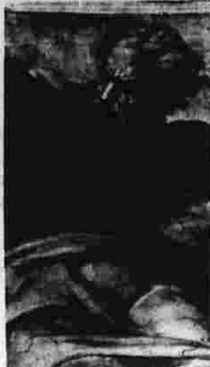
God on the Sistine Ceiling in ABC's "The Secret of Michelangelo: Every Man's Dream," Sunday 7-8 p.m.

"Circle of Deception" '61. British agent, tortured by Nazis, tells all he knows. Bradford Dillman, Suzy Parker, Harry Andrews (30) Huntley — Brinkley Report (40) Truth or Consequences (C) (22-30-40) News — Weather, Sports and Features (C)